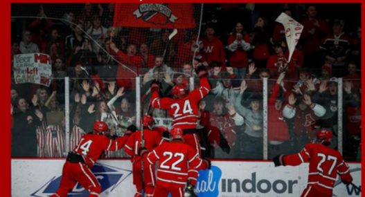
WIAA State Hockey Tournament