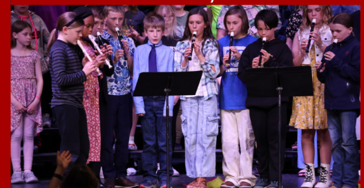
Fifth Grade Concert