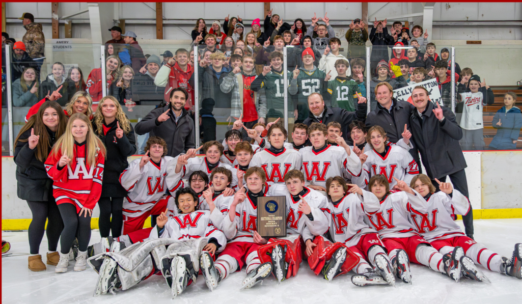
Amery Warriors Hockey WIAA Sectional Champions!