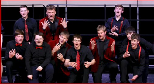
AHS Fine Arts Concert