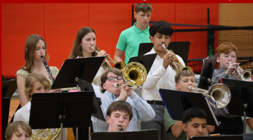
Middle School Spring Concert