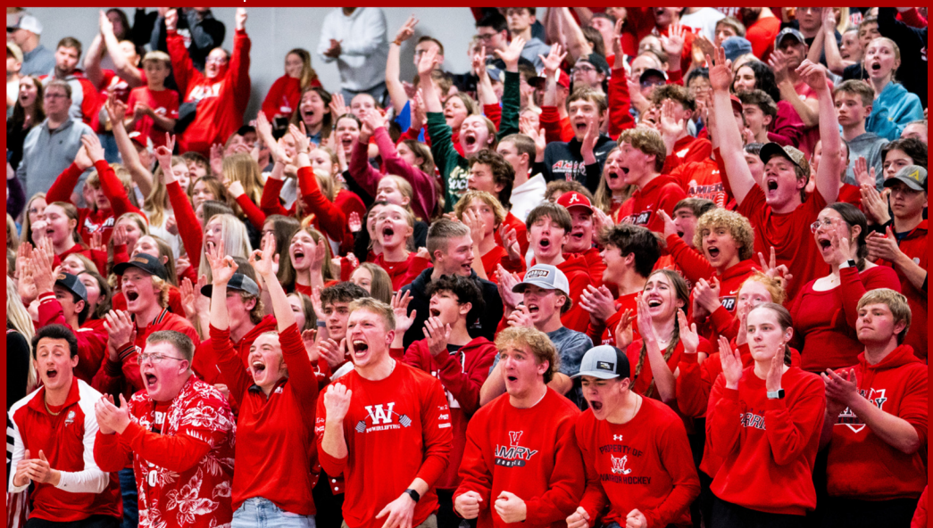
Amery Warriors Super-Fans!!