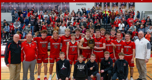
Basketball WIAA Regional Champs!